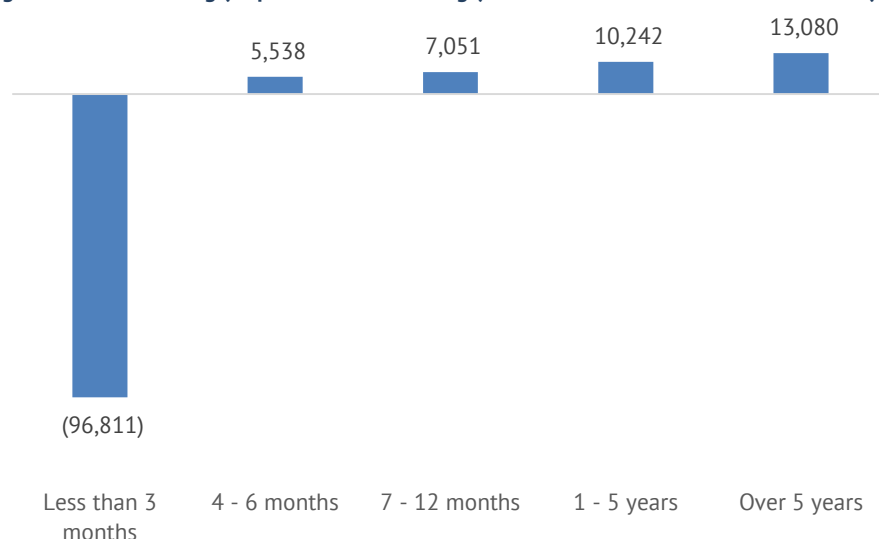
Figure 3: Loan-Funding (Deposits and Borrowings) Mismatches as at 31 December 2021 (₦' million)

As at 31 December 2021, Globus Bank's liquid assets amounted to ₦85.3 billion, a 16.9% growth from the prior year. As at the same date, liquid assets represented 38% (FYE 2020: 88%) of LCY deposits, higher than the 30% regulatory minimum. As the CBN continues with its contractionary monetary stance, we anticipate intense pressure on the liquidity ratio. However, we do not expect the liquidity ratio to decline below the 30% regulatory threshold. We believe that the gradual increase in the yields will renew the appetite for treasury instruments which will support the liquidity ratio of the Bank.